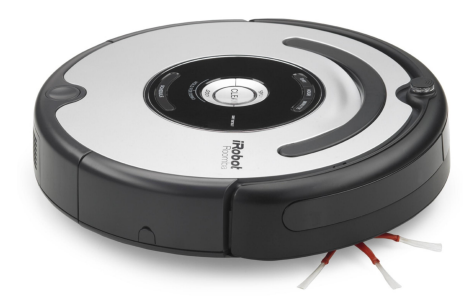
(a) iRobot Roomba. [32]

The second robot is the RIKEN RI-MAN [50] (see Figure 4(b)), a personal assistant robot currently under development. RI-MAN is designed to lift people who need assistance and to carry them around their homes. The RI-MAN can dramatically improve the quality of life for the people it helps, and lower their dependence on other individuals. Unlike the Roomba, which works by itself (to clean floors) and stays out of the way, the RI-MAN is designed to directly work with humans, its users being the most crucial component of its design