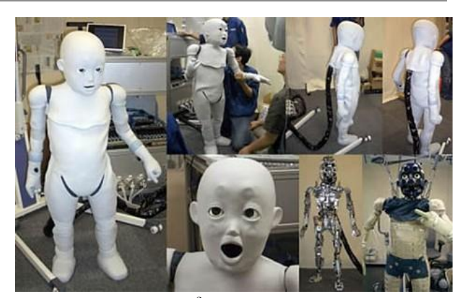
(a) CB^2 baby robot. [44]