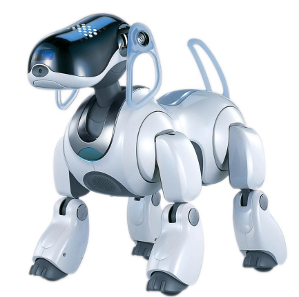
Fig. 5 The Sony AIBO Robotic Dog.

As robotic toys become more capable we may see a similar thing happen. For example, a Robosapien-likerobot that has just enough awareness of its surroundings to naively follow its owner and play simple games, help them fold the laundry, or even tell a few jokes, would be well beyond any toy available today. To many