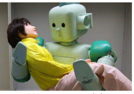
(b) RIKEN RI-MAN. [50]