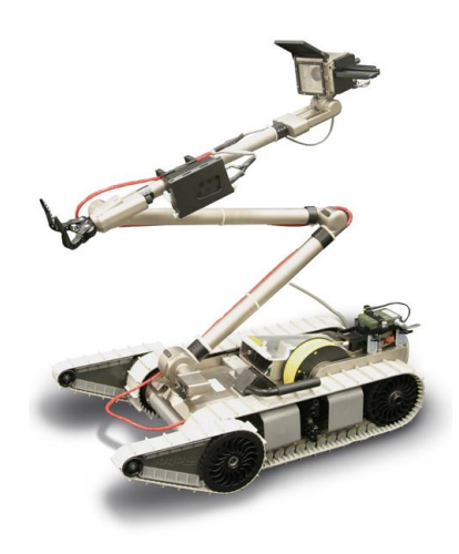
Fig. 7 The iRobot Packbot. [33]

As intriguing as the idea of robotic companionship may seem, however, it is doubtful that this idea will have any initial impact on intention to adopt beyond what existing toys and electronics already offer. Robots are currently very limited, and people will likely not consider the deeper reaches of the companionship factor until there is experience and a cultural understanding